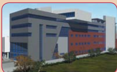
Eglimatologiko - Greece