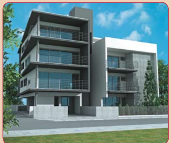
Onisilos residence - Cyprus