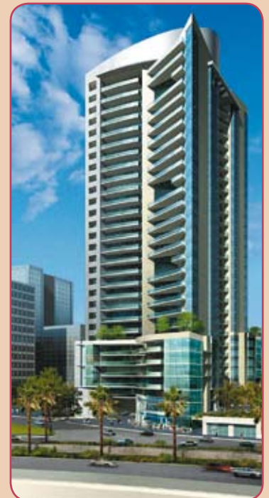
Beirut Tower - Lebanon