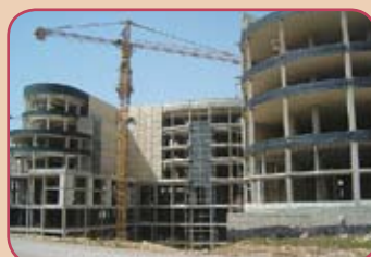
Sham Mall - Syria