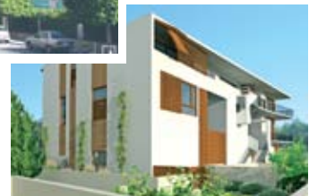
Cyprus / Hellas Residence