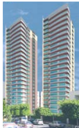
Lebanon / Nova Towers