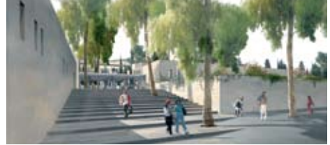
Syria / French School