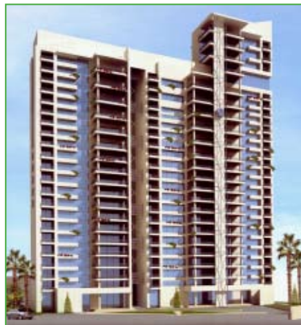
Lebanon: Carlton Residences