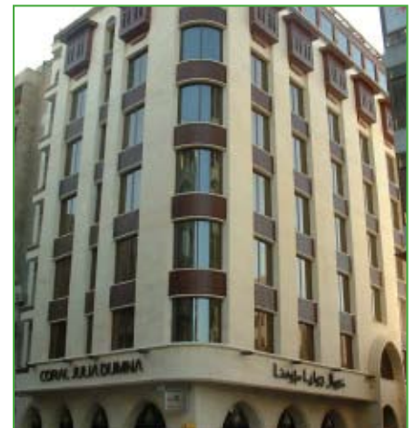
Syria: Julia Dumna Hotel