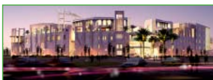
Jordan: Taj Mall