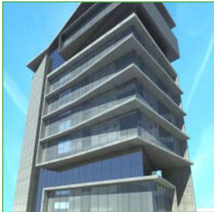
Cyprus: Quality Group Offices

Taj Mall Abdoun: 12 Elevators, 54 Escalators, 6 Moving Walks Villa Nuqul Abdoun: 1 Elevator Villa M. Hammoudi: 1 Elevator Villa K. Al Rawi: 1 Elevator Royal Palace: 1 Elevator