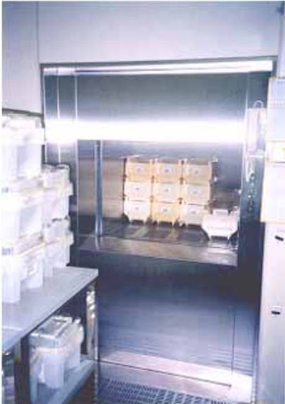
Scene of cassettes loading