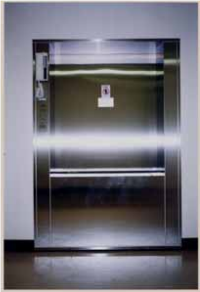
Table type Dumbwaiter

Best Dumbwaiter for vertical moving in clean room of Semi Conductor Factory · Hospital · Food Factory etc.