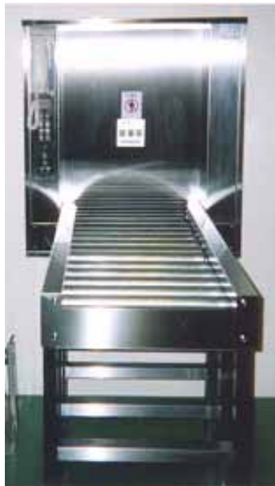
Fully automatic table type / RTAC