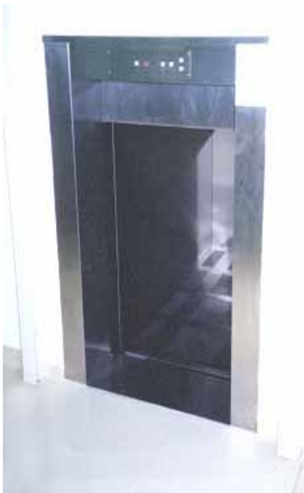
Standard floor type / RLC